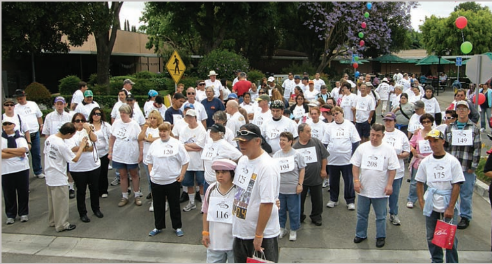
Walk on the Horizons 2009. Our third annual Walk on the Horizons will take place June 6, 2010 at Cal State University, Northridge.