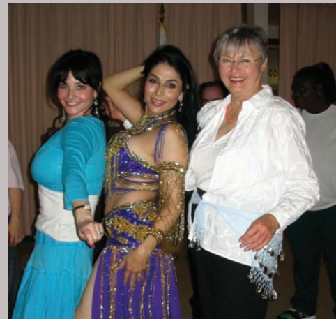
New Horizons' volunteers are shown our appreciation, and a good time, at Annual Volunteer Recognition event in April.