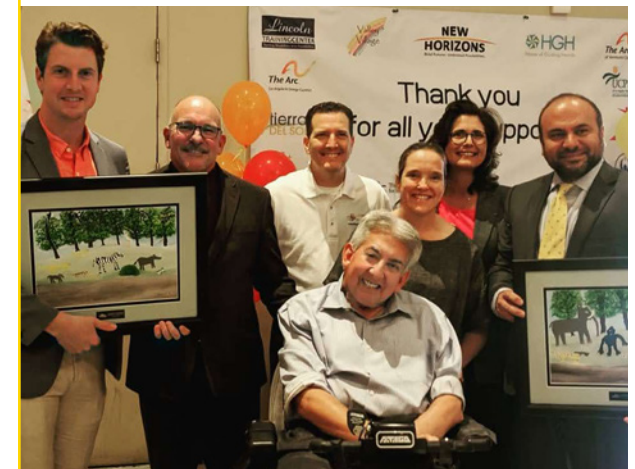
Legislative Thank You Luncheon, Aug. 23, 2019

Note: By the end of Fiscal Year 2020, just as what was hoped for, New Horizons achieved its $250,000 goal thanks to you, our generous supporters!